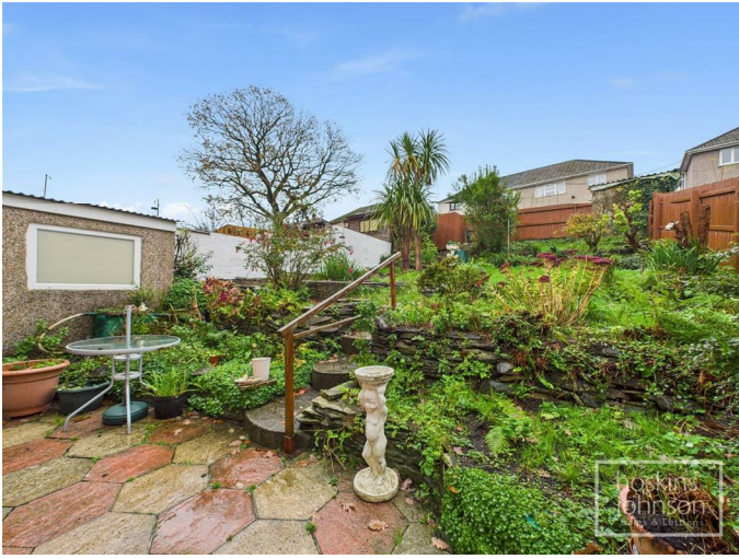
Front garden with off road parking. Side access leads to lightly tiered garden with seating area, lawns and mature bushes.